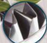
OASIS™ 1" Flat Wire