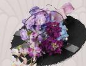
NEW! OASIS™ Bouquet Collar