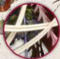
OASIS™ Midollino Sticks