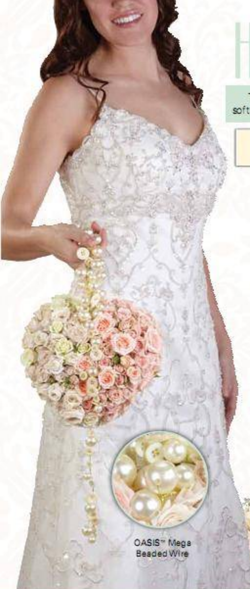
OASIS™ Mega Beaded Wire