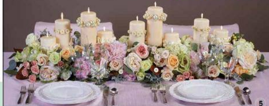
NEW SIZE! OASIS® 36° RAQUETTES® Holder

4 Watch our Design Directors show you how to add a vintage Heirloom look to your wedding designs at www.oasisfloral.com/youtube .