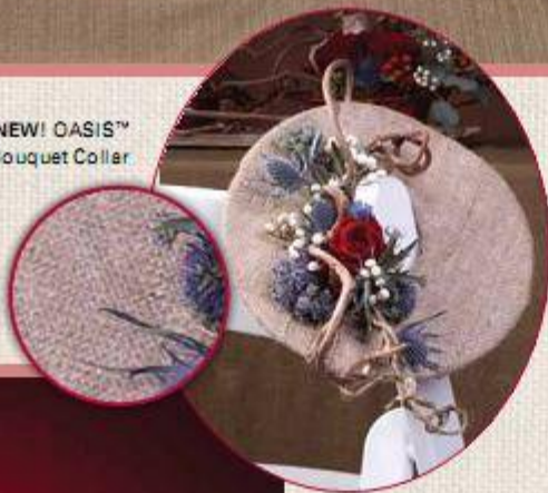
NEW! OASIS™ Bouquet Collar