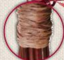
NEW COLOR! Brown OASIS™ Bind Wire