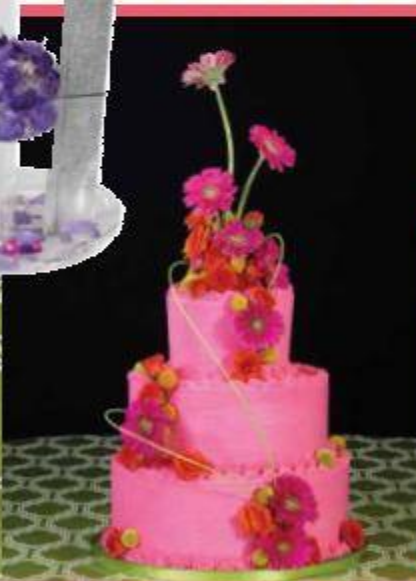
NEW! OASIS™ Button Wire