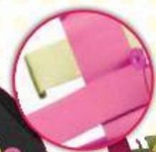
OASIS™ 1" Flat Wire