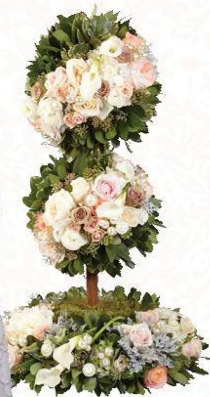
NEW! OASIS™ Brooches