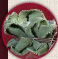
NEW! OASIS™ Raw Muslin & Brown OASIS™ Bind Wire