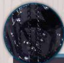
NEW! OASIS™ Chain