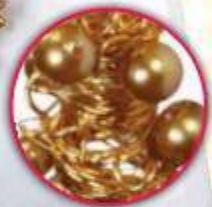
OASIS™ Mega Beaded Wire