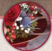
ESSENTIALS™ Oval Containers