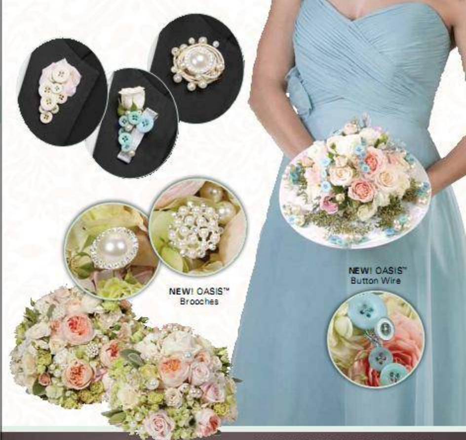
NEW! OASIS™ Button Wire